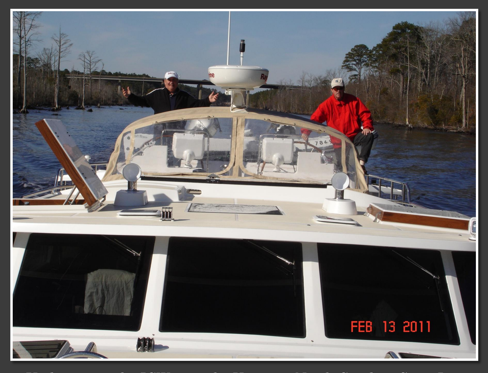
Underway in the ICW near the Virginia, North Carolina State Line