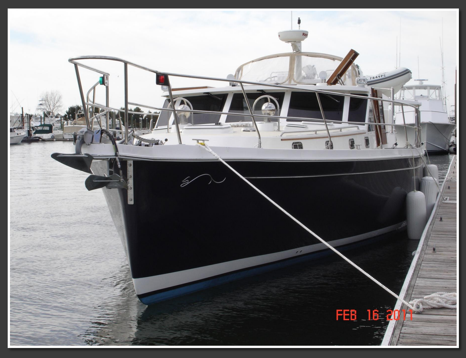
At the dock in Wrightsville Beach, North Carolina for fuel