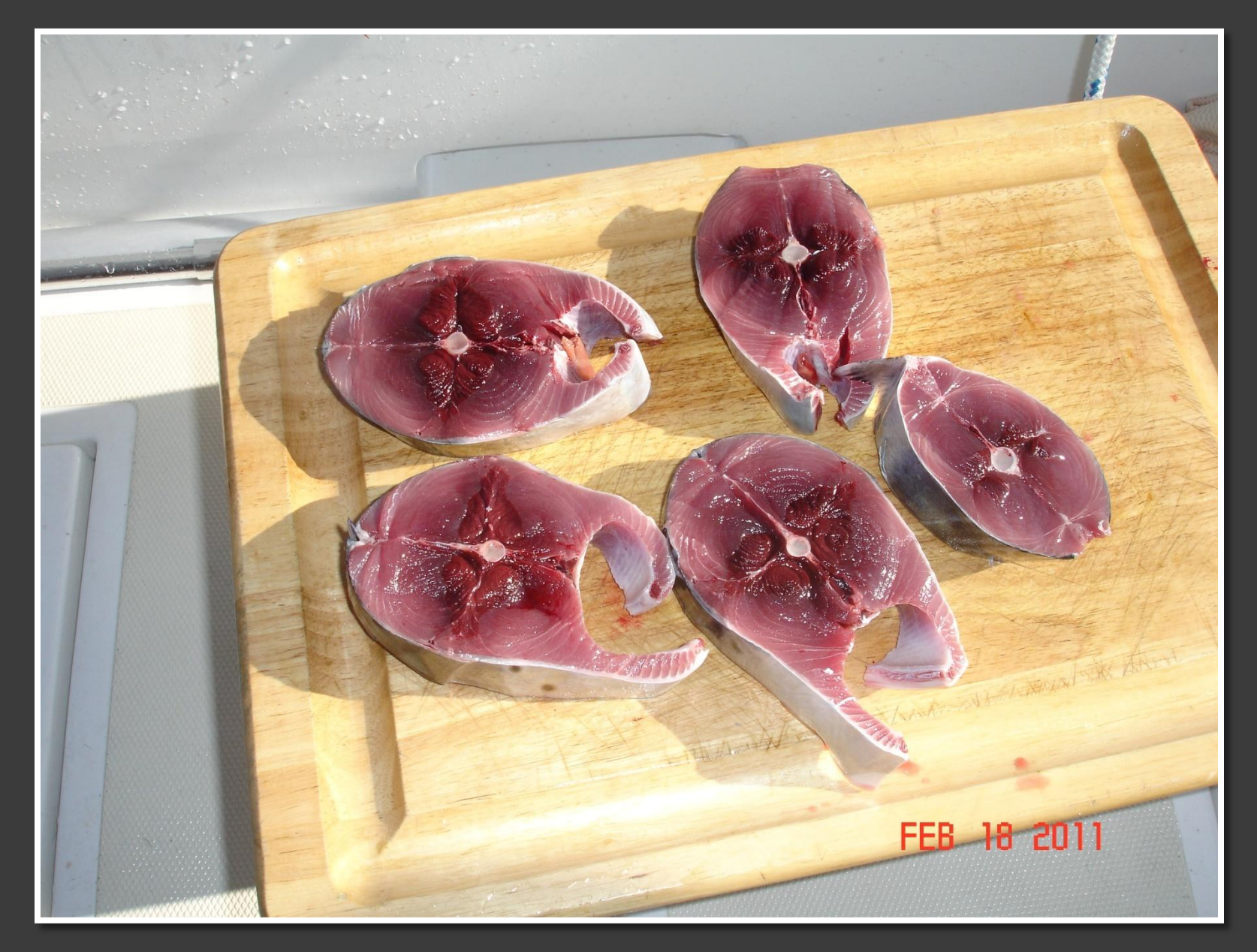
Did I mention fresh tuna for lunch?