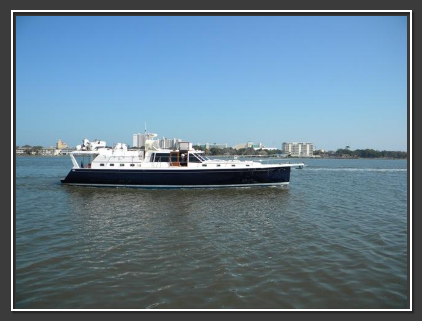
Photo 4 of 4 in Daytona Without her rig she still looks great.