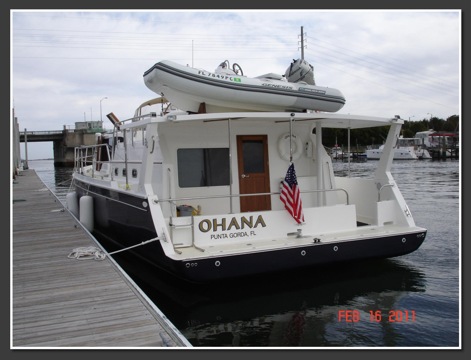
Her 18 foot beam is evident with this shot from the stern