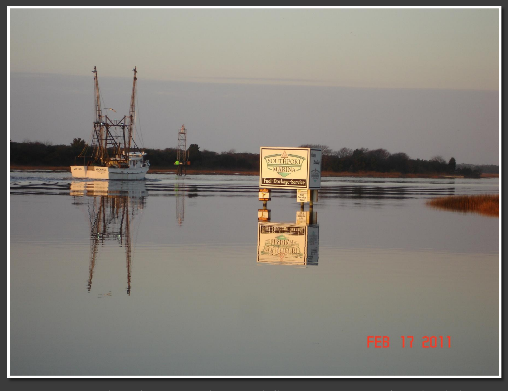
It was an early calm as we departed Cape Fear River for The Atlantic