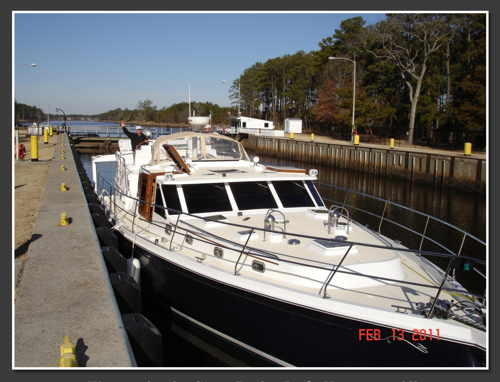
Waiting for the Great Bridge Lock, Virginia to fill