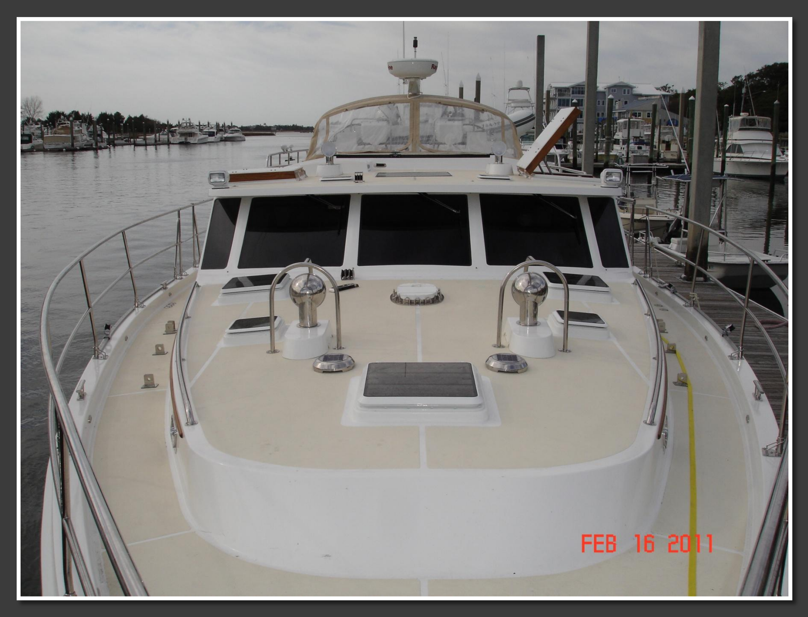
Another view looking aft from the bow.