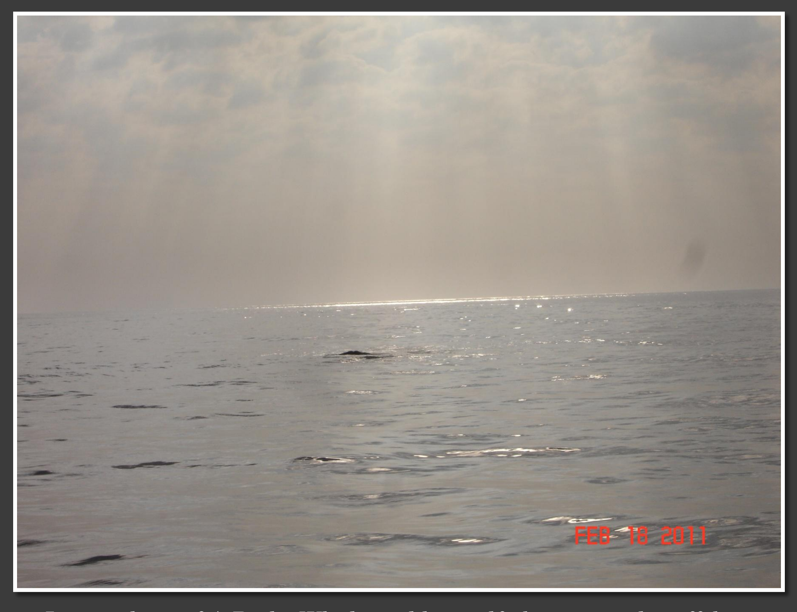
Lousy photo of A Right Whale and her calf about 60 miles offshore